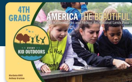
2022-2023 4th Grade Pass