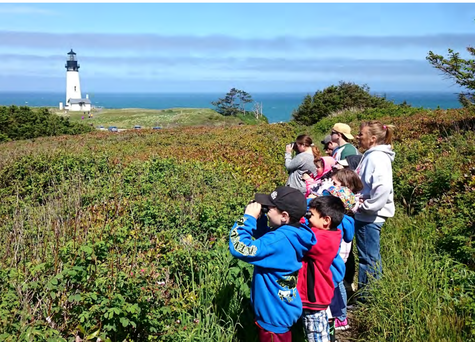
Yaquina Head Outstanding Natural Area (BLM), Stacia Bartrom.