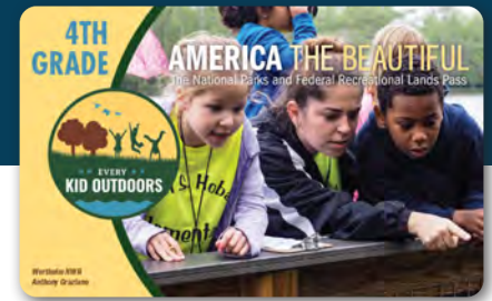
2022-2023 4th Grade Pass